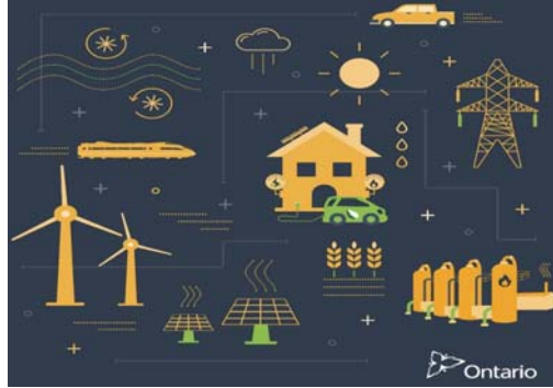
DISTRIBUTION LEVEL (DEPENDS)