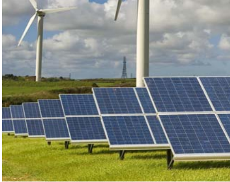
SYSTEM LEVEL ('JACK-KNIFE')